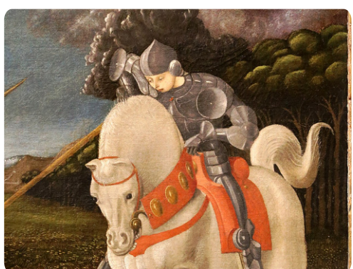
Artist: Paolo Uccello