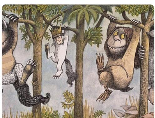
Artist: Maurice Sendak