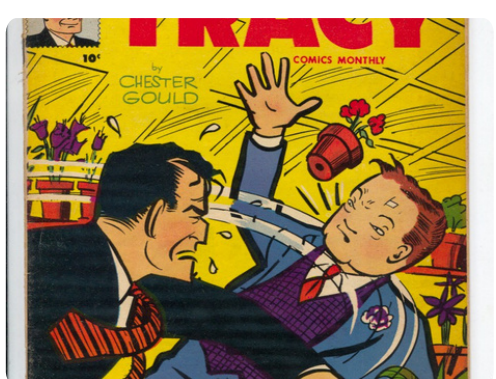
Artist: Chester Gould