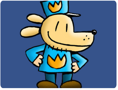
Artist: Dav Pilkey