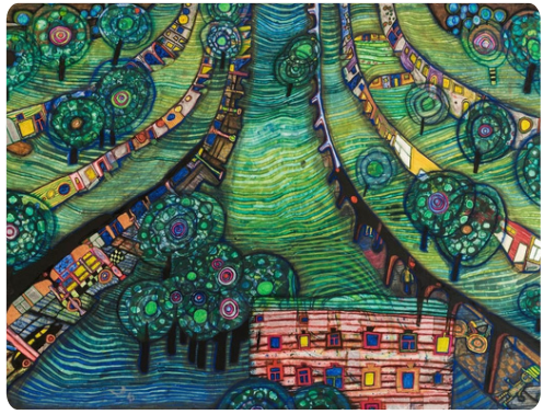
Artist: Friedensreich Hundertwasser