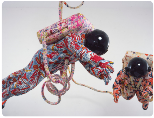
Artist: Yinka Shonibare