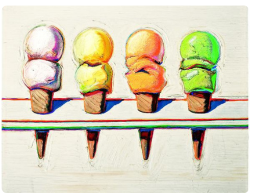
Artist: Wayne Thiebaud