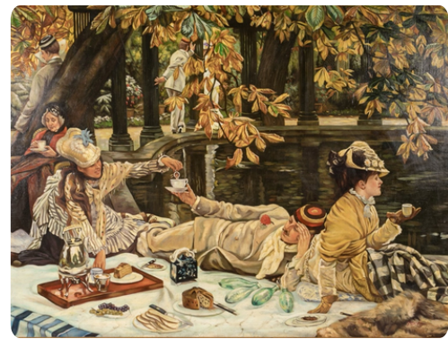
Artist: James Tissot