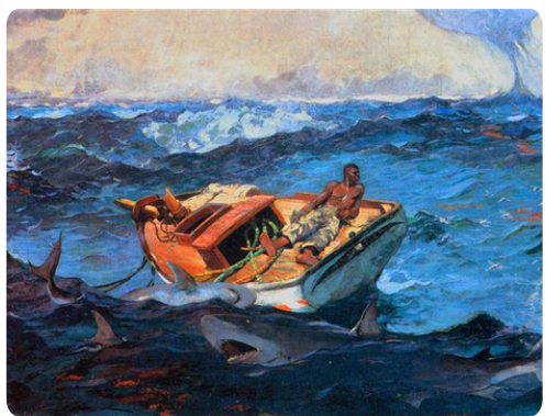
Artist: Winslow Homer